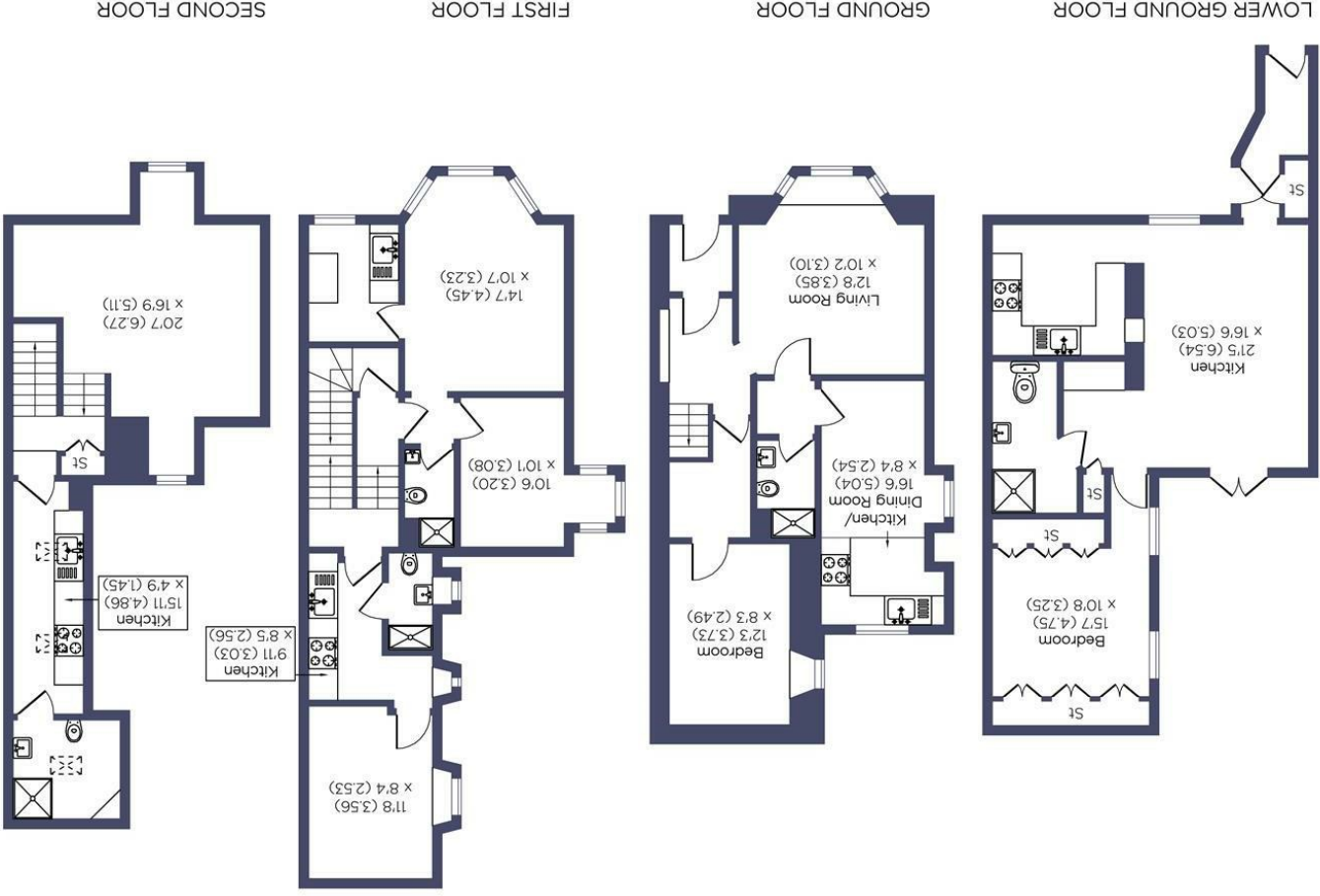
Bay View Terrace, Newquay, TR7 Approximate Area = 2172 sq ft / 201.7 sq m